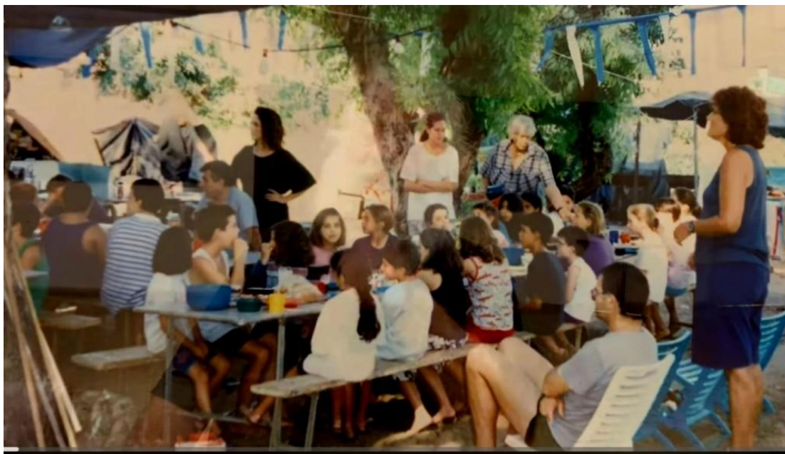
A dedicated team