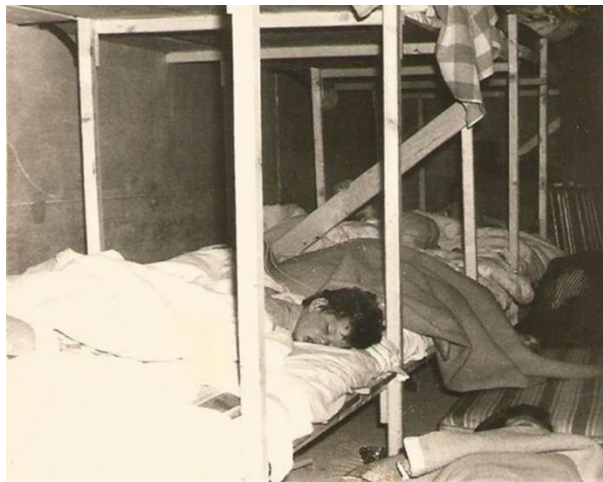
During the Six-Day War, the children of Yizrael slept in shelters. (Does someone recognize the child?)