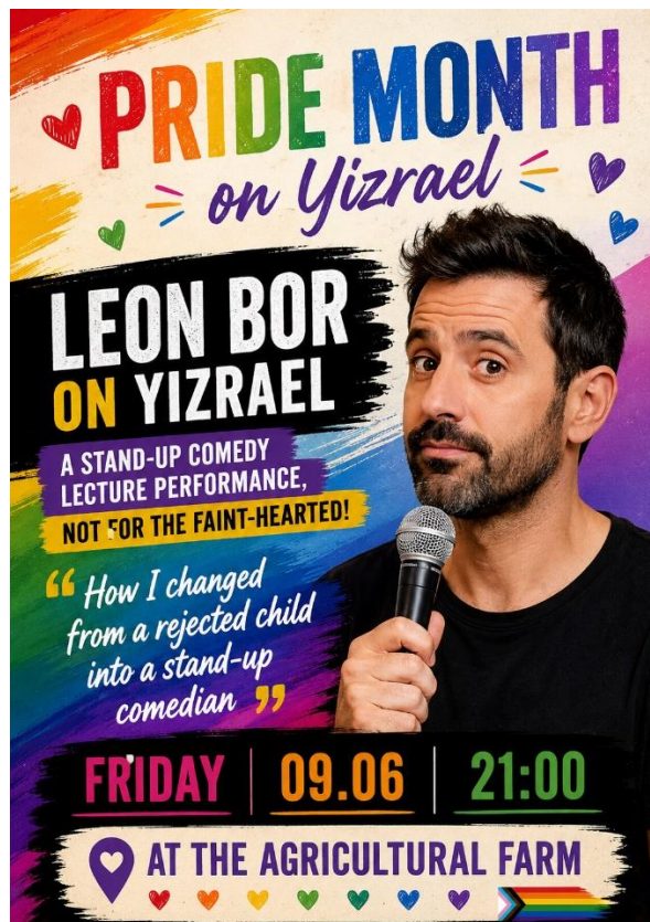
(Note: The picture is not Leon Bor, who is just as good-looking – Ed.)