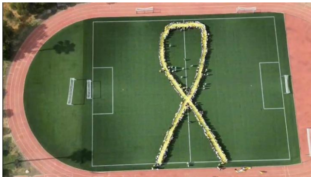
High school children, Amal Emek Harod