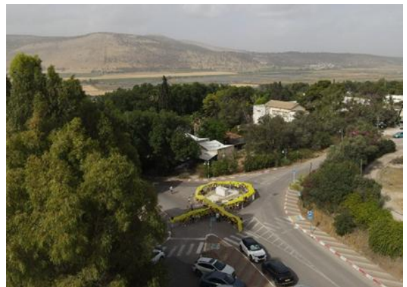
Elementary school children, Emek Harod