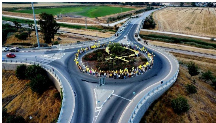
People from all the settlements in the area on the 600th day at 6:00 AM