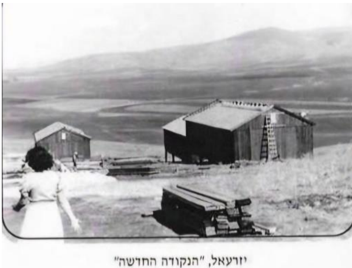
יזרעאל, "הנקודה החדשה"