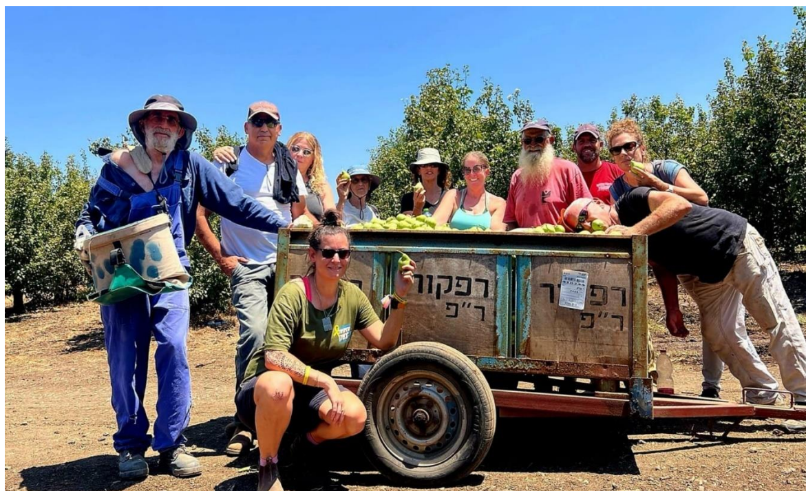
Picking Pears in Kidmat Tzvi – Chag HaMeskek