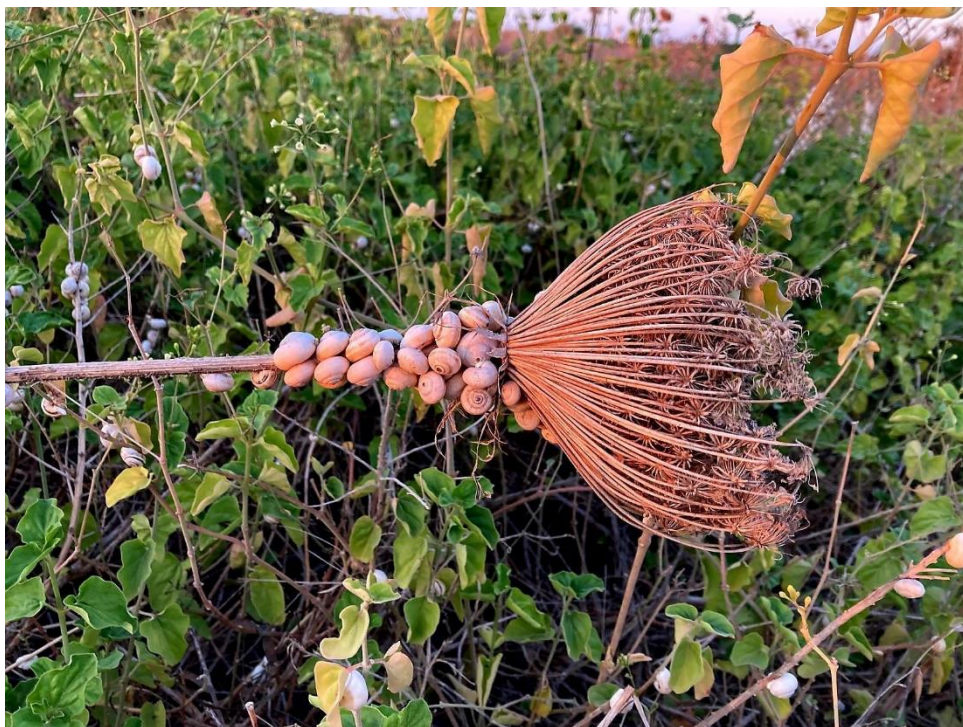
Snails on Wild Carrot

Veterans Tiylul to the Aqueduct Beach, Caesarea