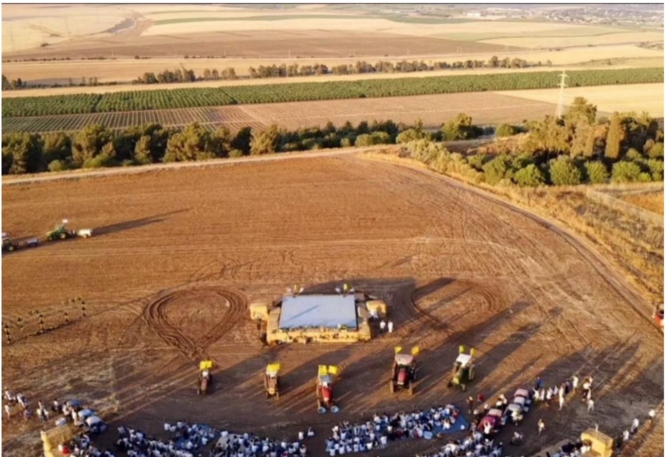
The Dance of the Tractors – Bird's eye view